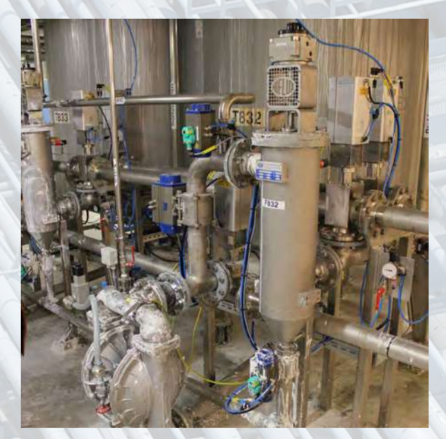
Rotating Auto-line® with pneumatic drive

The filter is designed with heavy duty industrial use in mind. It handles highly viscous, sticky, abrasive and even very hot products without any problems.