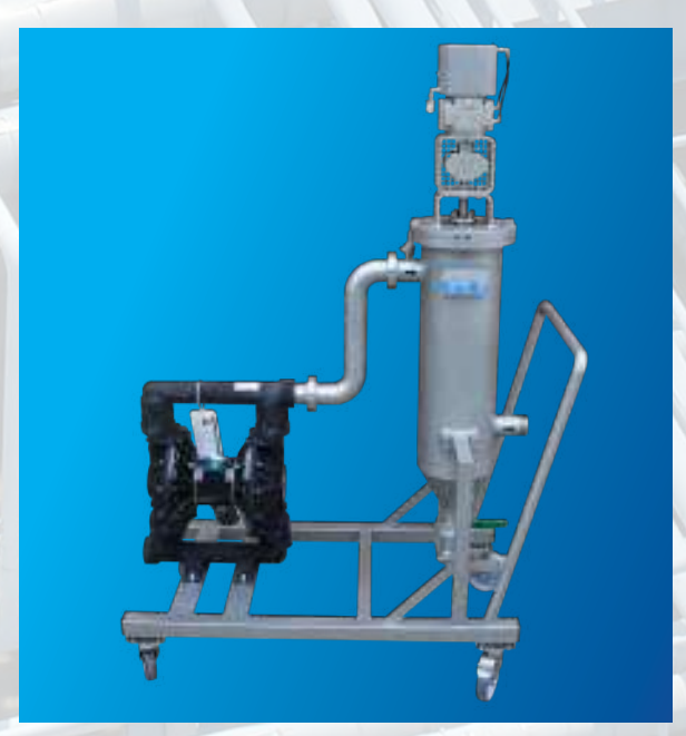
Auto-line® LR-P filter cart with diaphragm pump

The top down access ensures that the media will stay inside the filter housing and that spillage on the floor is limited.