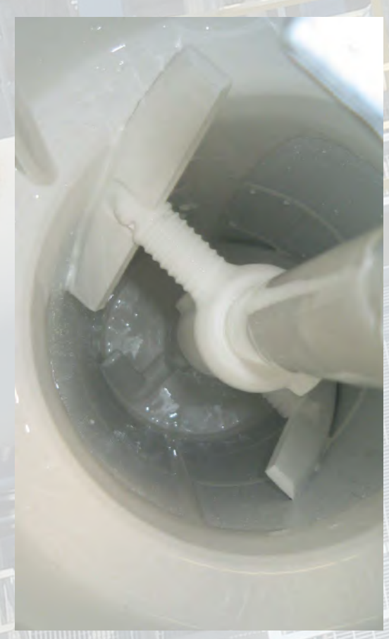
Solid spring loaded rotating scraper system.