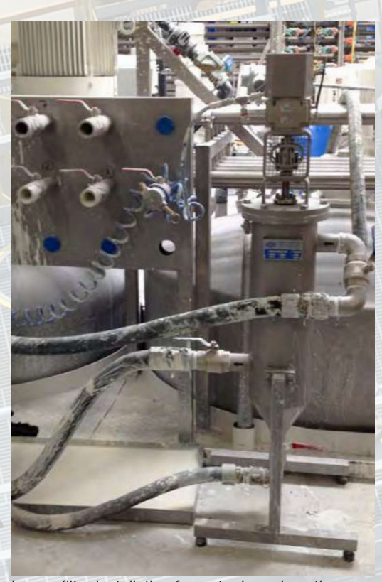
Larger filter installation for water based coatings