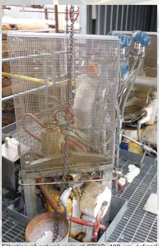
Filtration of natural resin at 275°C, 100 µm defined pore filtration.