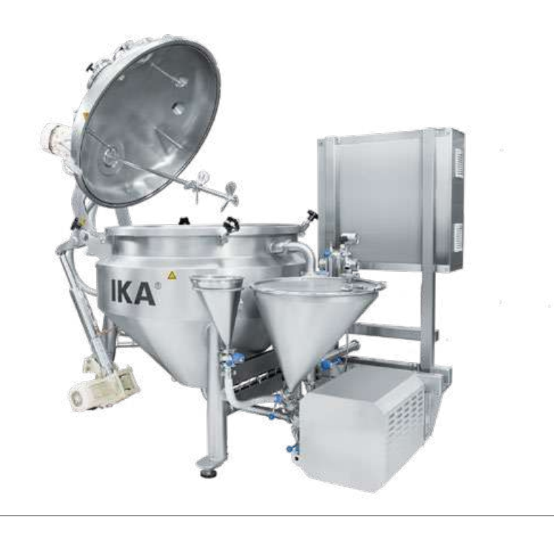
The CMX solid-liquid mixing system is available as an individual machine, and it can also be integrated into customer-specific IKA plants.