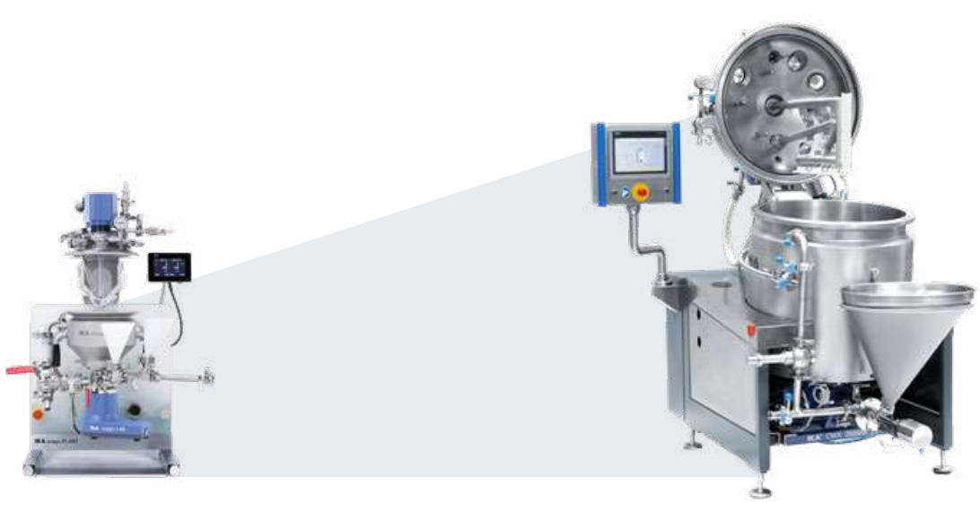
magic PLANT inline

The magic PLANT inline laboratory plant has been developed to create product recipes and to identify process requirements. It is capable of homogenizing, emulsifying, dissolving and dispersing products over a wide range of viscosities. This makes it the ultimate simulation of an IKA process plant: the recipes that you create using the magic PLANT inline can be manufactured in the same process, thanks to the consistent installation concept using Scale-Up. As an alternative, the application can be simulated in Scale-Down, to determine the changes in process parameters or the content materials, initially on a small scale, without the expenditure of large volumes of product.