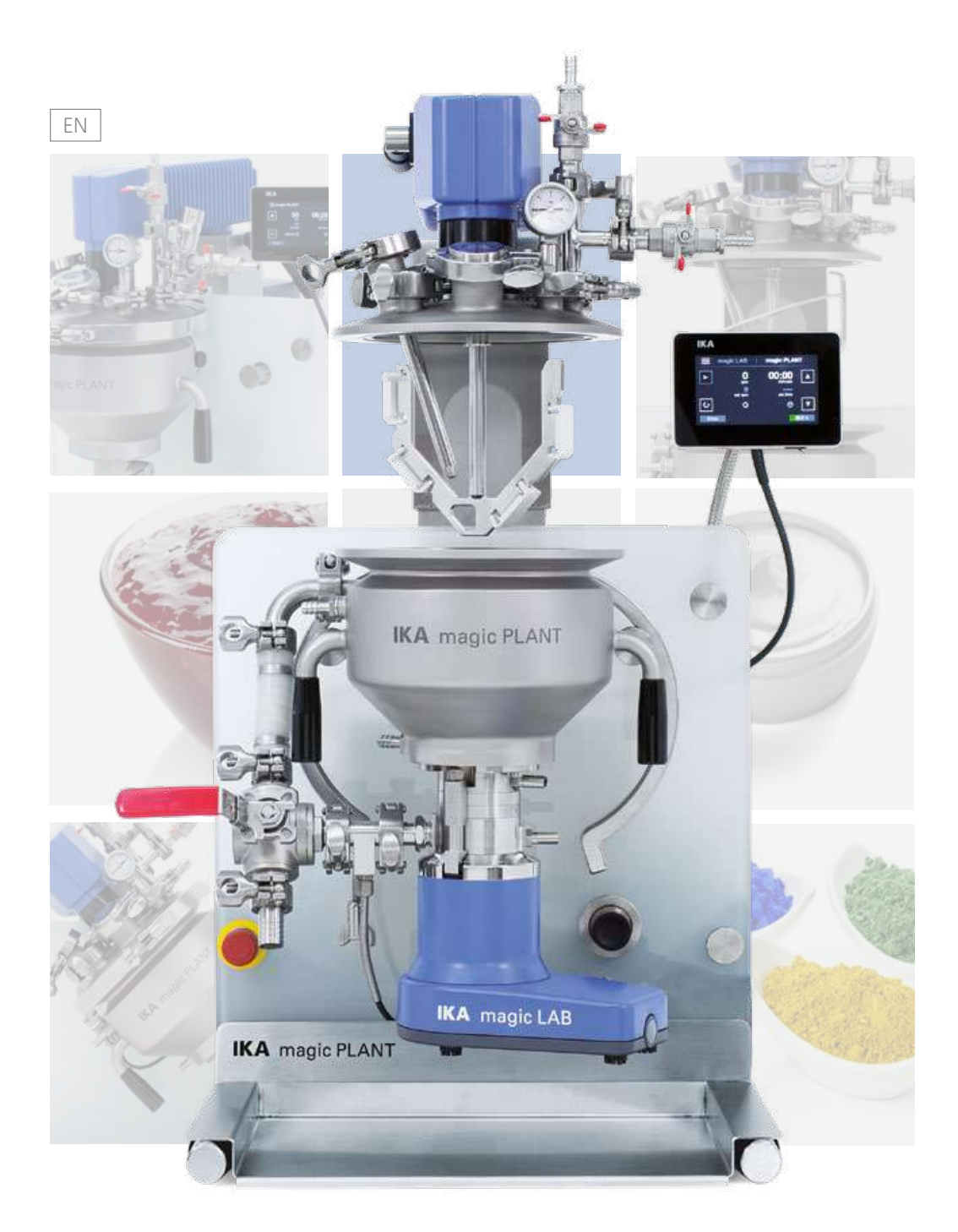
MODULAR PROCESSING PLANT ON A LABORATORY SCALE IKA magic PLANT