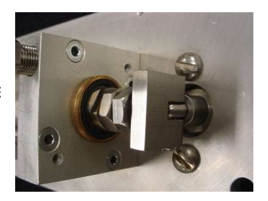
TOGGLE VALVE OPERATOR