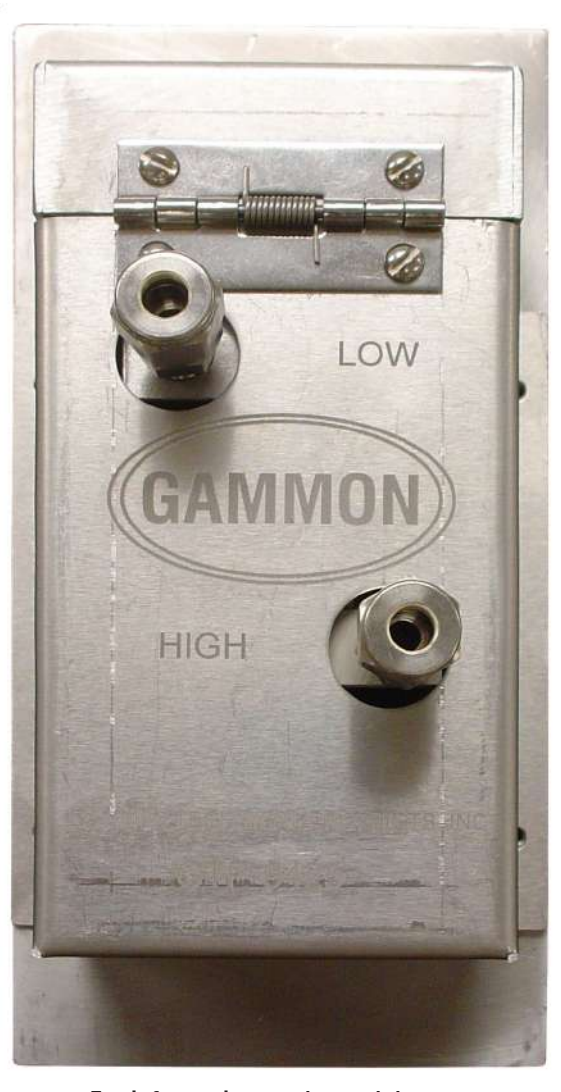
For information on the push button Gammon Gauge, see Bulletin 25.

Hydraulic GTP-9425-H Air Operated GTP-9425-A