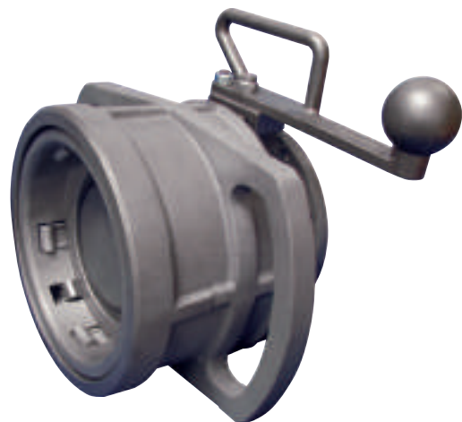
1004D3 (large handles)