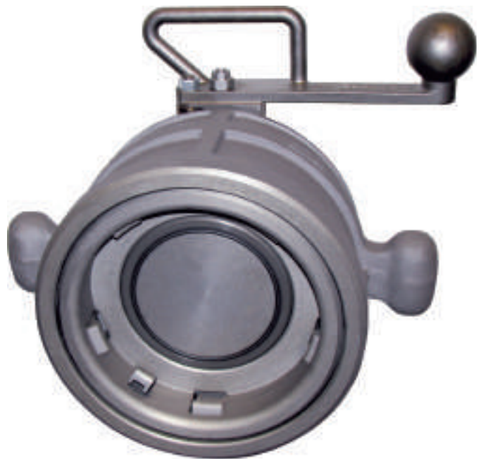
Patent pending 1005E3 (small handles for European market)