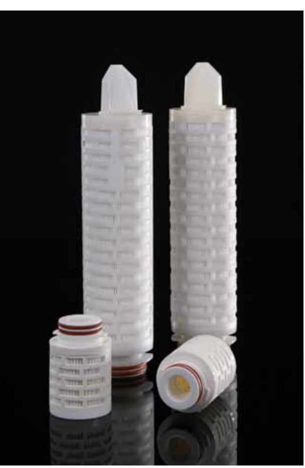
Note: TETPOR is a registered trademark of Parker domnick hunter