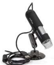
100x Magnification, USB operated desktop microscope