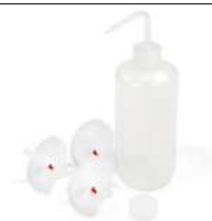
Solvent dispenser with dispensing filters