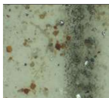
Visual correlation chart to determine approximate ISO Cleanliness Code of patch test kit sample