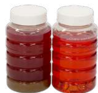
Sample bottles (6)