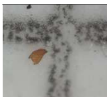
Visual correlation chart to determine type of particles captured on the patch