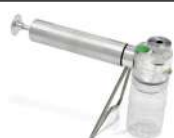
Vacuum pump to extract fluid samples from the system and process 25 ml sample through filter patch