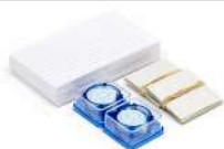
1.2µm and 5.0µm filter test patches with patch mounting cards and adhesive covers to protect samples from ambient contamination and to preserve samples for future reference