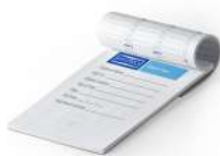
Patch Analysis Card Booklet

For all up to date option details and compatibilites, please reference our Contamination Solutions Price List or contact customer service .