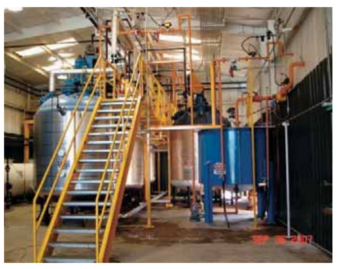
Figure 2. Interior view of Alterra Energy Facility