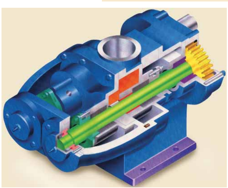
Figure 5. Circumferential piston pump with dual external bearing support