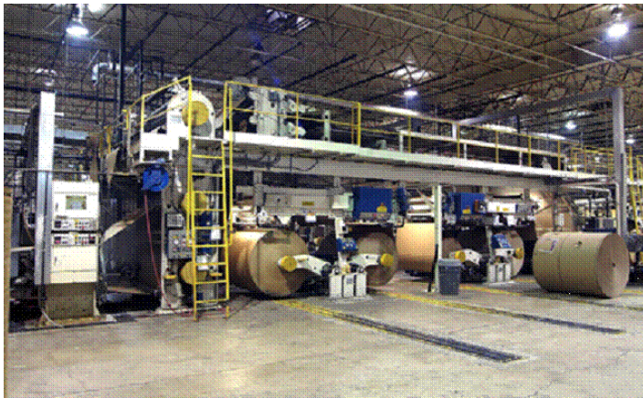
Figure 2: Corrugator Machine

Starch-handling internal gear pumps are most often not supplied with safety-relief valves. Line blockage because of the starch settling out in the discharge piping is a fairly common occurrence, and pump and mechanical seal damage can happen in the event of line blockages with no pump relief valve for overpressure protection. On the other hand, in the event of pressure spikes, the relief valve can open and not reseal, resulting in relief valve chattering, bypassing of fluid, and loss of flow.